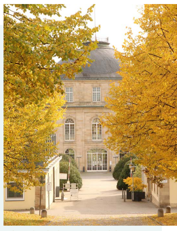
FACULTY OF AGRICULTURAL SCIENCES WINTER SEMESTER 2023/24